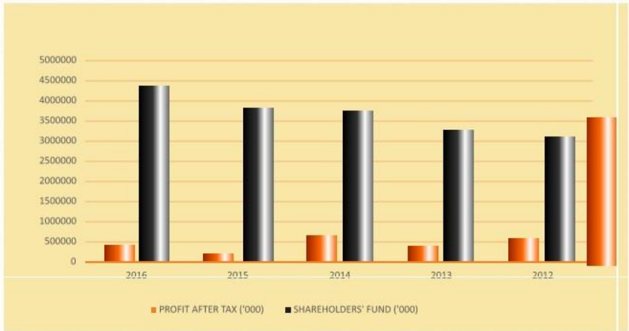
PROFIT AFTER TAX VS SHAREHOLDERS' FUND COMPANY